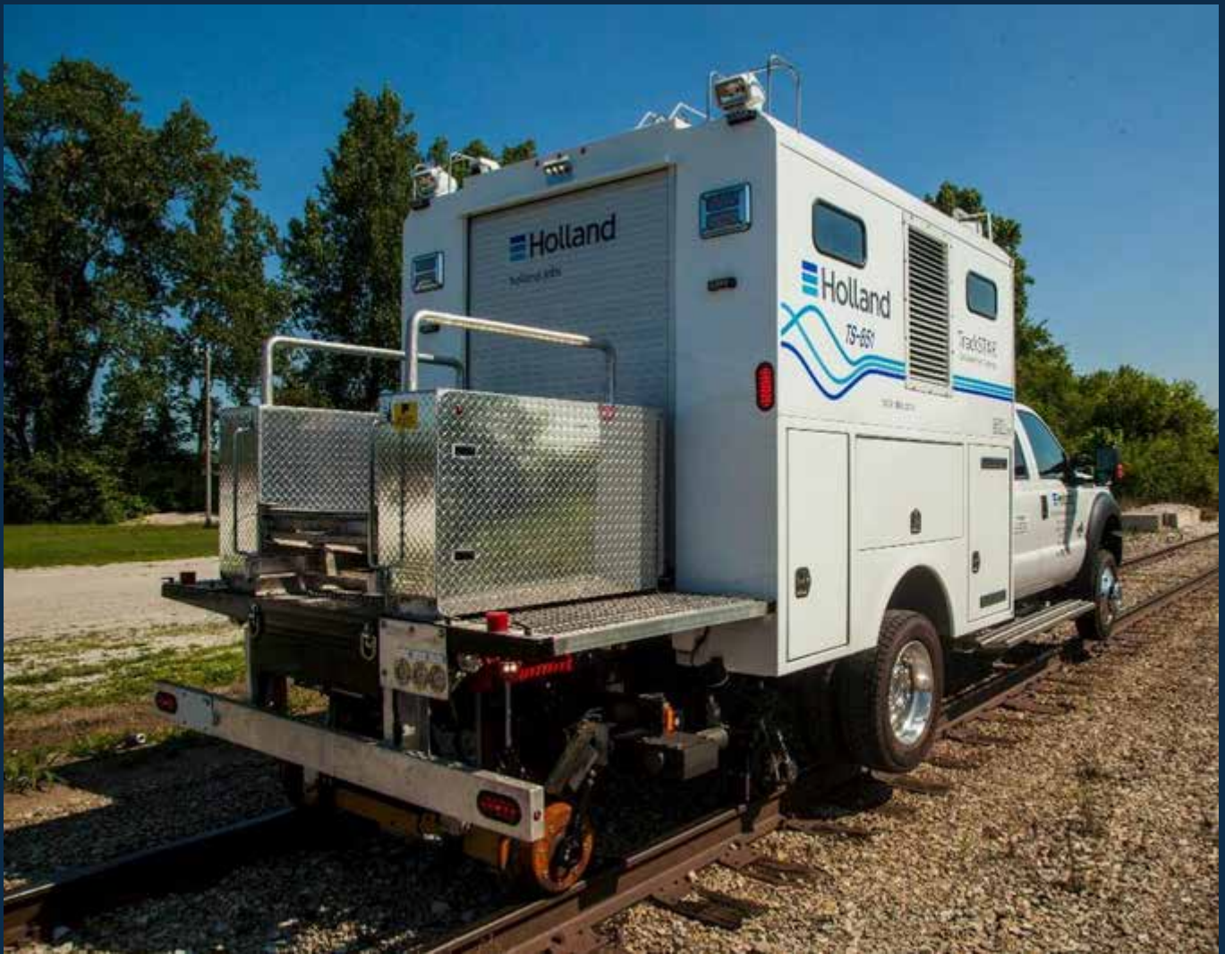
800-series TrackSTAR® vehicle

Holland's fleet of track testing vehicles are designed to satisfy the track geometry and rail profile measurement requirements of Class 1, Regional, Short Line, and Transit properties in North America.