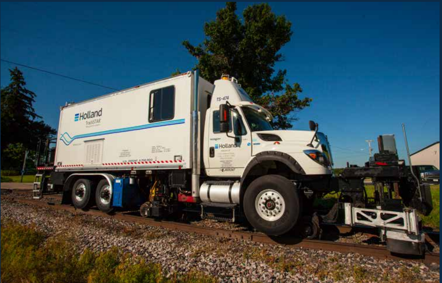
A TrackSTAR® unit equipped with Gauge Restraint Measurement System.

Track gauge strength measurement systems have been used to identify a range of geometry-related issues that occur under “dynamic,” i.e., loaded, as well as under “static,” i.e., unloaded, conditions. Visual inspections and those performed with light hi-rail vehicles without a load axle that applies a consistent lateral load are able to obtain static or near-static measurements. Railbound geometry cars, like those used by Class 1 railways, are able to obtain dynamic vertical measurements and unspecified lateral loads in curves. But only geometry cars equipped with Gauge Restraint Measurement Systems, such as the Holland TrackSTAR fleet, are able to apply a constant, controlled lateral load in all segments of track — curves and tangents — to identify weak track, especially as it applies to poor tie conditions on timber- and concrete-tie track.